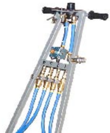
Bottom: Operator control area of the push handle assembly showing the handle bar grips, trigger control switch and air inlet from shop air supply.

www.rotairsystems.co.uk • info@rotairsystems.co.uk