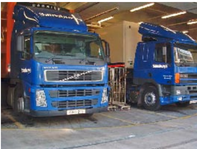
Above: A commercial vehicle turntable designed for rotating the UK's largest and heaviest articulated vehicles.